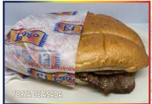
TORTA DE ASADA

WE ARE NOT RESPONSIBLE FOR ANY PERSONAL ITEMS LEFT BEHIND. *Warning: Consuming raw or undercooked meats, poultry, seafood, shellfish, or eggs may increase your risk of foodborne illness, especially if you have certain medical conditions.