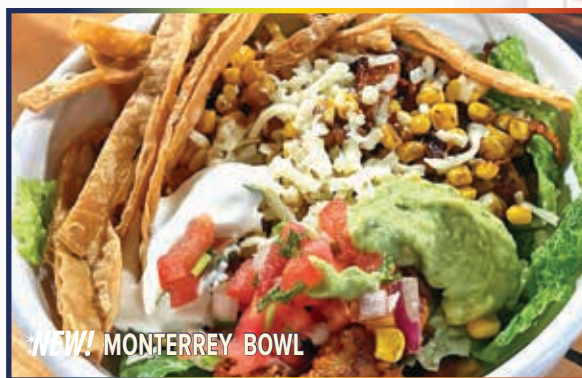
NEW! MONTERREY BOWL