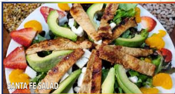
SANTA FE SALAD