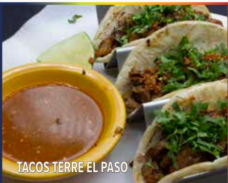
TACOS TERRE EL PASO

Three pork shoulder tacos prepared with red guajillo dry pepper, marinated in a special sauce and cooked with pineapple and onion. Served with a side of rice, lime and cilantro – 16.99