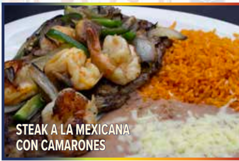
STEAK A LA MEXICANA CON CAMARONES