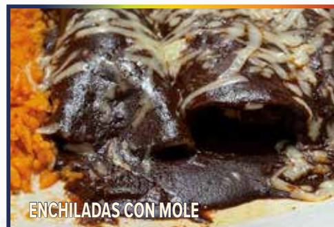
ENCHILADAS CON MOLE