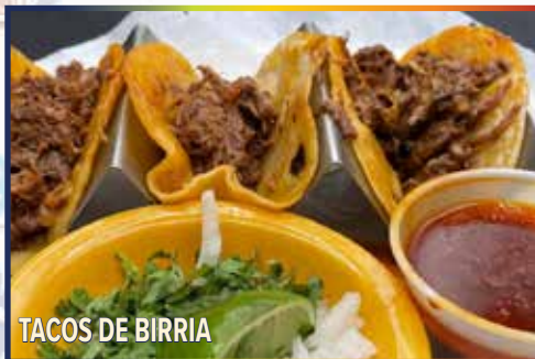
TACOS DE BIRRIA