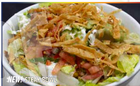
NEW! STEAK BOWL