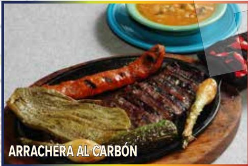
ARRACHERA AL CARBÓN