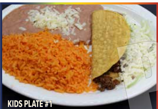
KIDS PLATE #1

Served with lettuce, tomato, sour cream, guacamole and rice – 9.99