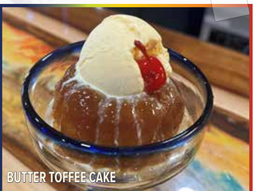
BUTTER TOFFEE CAKE