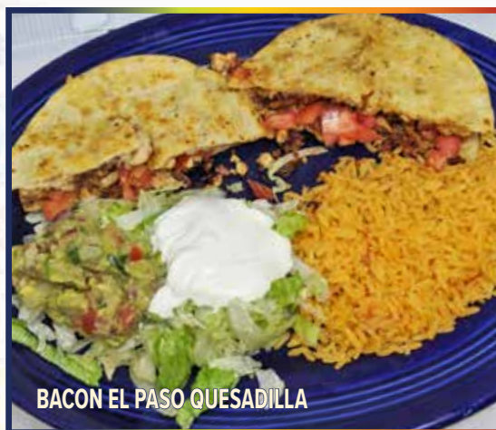
BACON EL PASO QUESADILLA