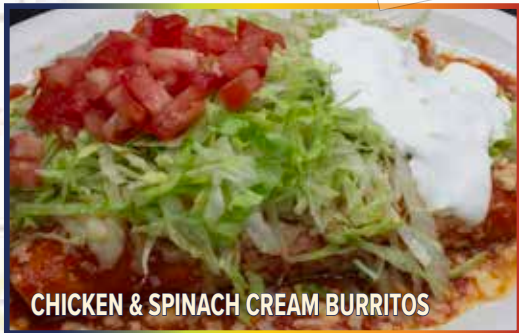
CHICKEN & SPINACH CREAM BURRITOS