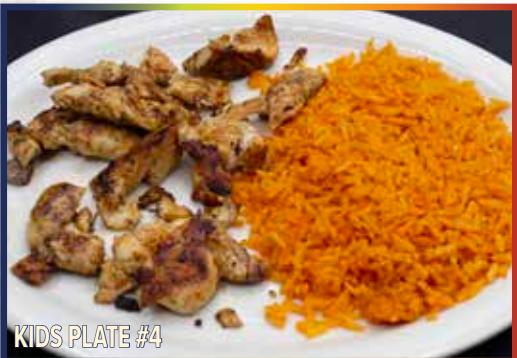
KIDS PLATE #4

One bean burrito, one cheese enchilada and one chalupa (a fried corn tortilla and topped with beans, lettuce, tomato and guacamole) – 11.99