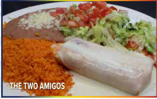
THE TWO AMIGOS