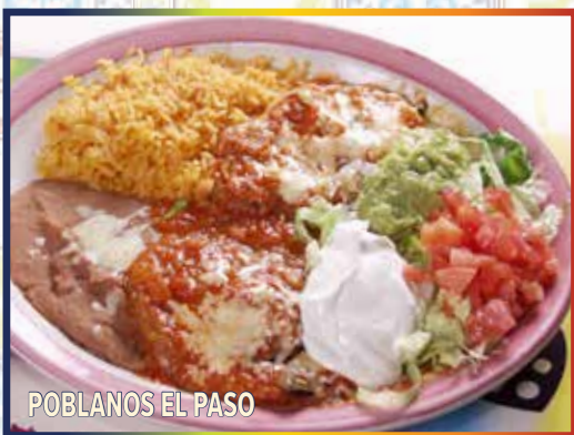
POBLANOS EL PASO