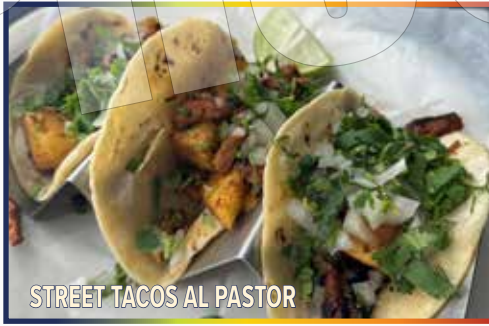
STREET TACOS AL PASTOR