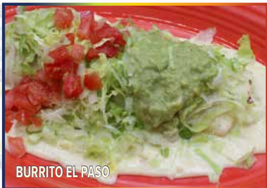
BURRITO EL PASO