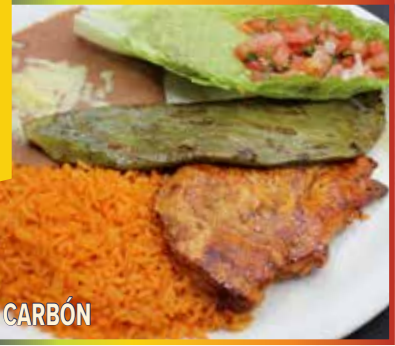
POLLO AL CARBÓN

EXTRA SUBSTITUTIONS WILL HAVE EXTRA CHARGES. NO SUBSTITUTIONS ARE ALLOWED WITHOUT EXTRA CHARGES. PLEASE ASK BEFORE YOU ORDER.