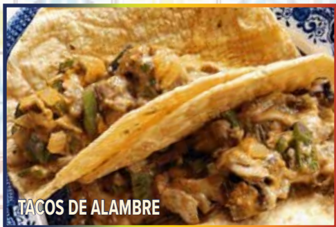
TACOS DE ALAMBRE