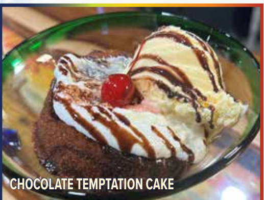
CHOCOLATE TEMPTATION CAKE