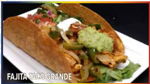
FAJITA TACO GRANDE

Two tacos served in a flour tortilla with avocado, pico de gallo and dressing – 10.99