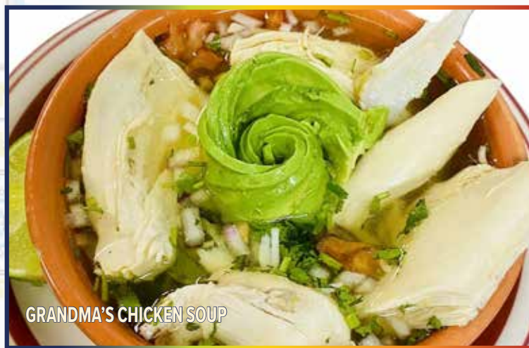
GRANDMA'S CHICKEN SOUP