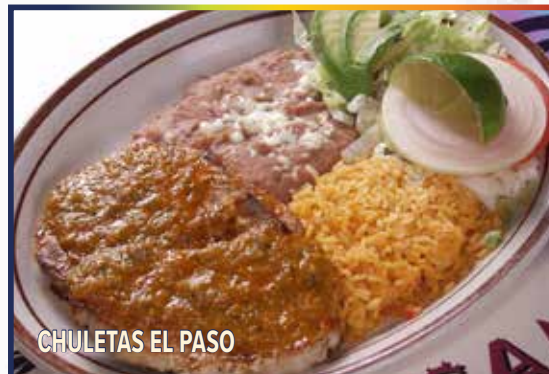
CHULETAS EL PASO